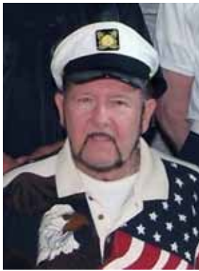
From the Founder's File: Chief Joe Gall