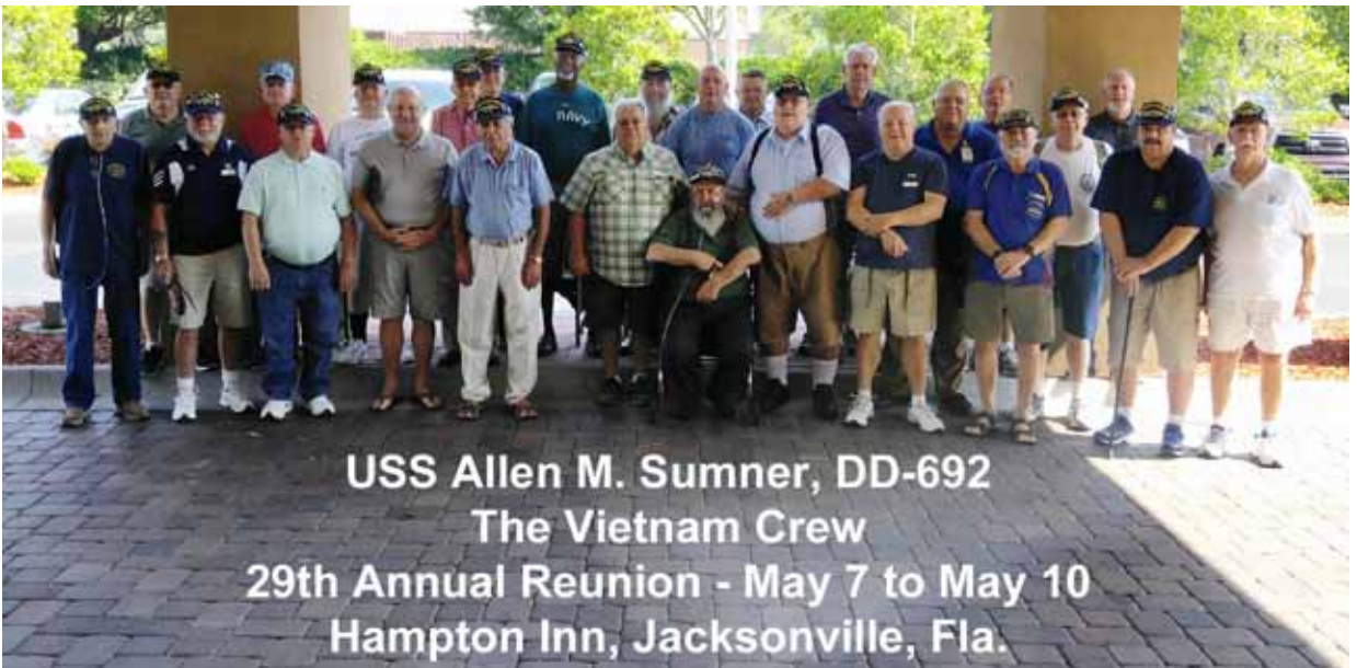
USS Allen M. Sumner, DD-692 The Vietnam Crew 29th Annual Reunion - May 7 to May 10 Hampton Inn, Jacksonville, Fla.