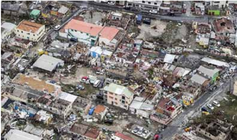
Typical example of Hurricane Irma's Wrath

Paulette and I live on the east coast of Florida in Palm Bay a little south of Melbourne. We started to feel the effects of Irma Sunday morning with squalls and wind gusts. All day long we were getting tornado warning there was at least one that touched down in Palm Bay. Because of