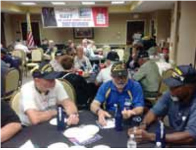
PHOTO GALLERY REUNION MEMORIES JACKSONVILLE, FLORIDA