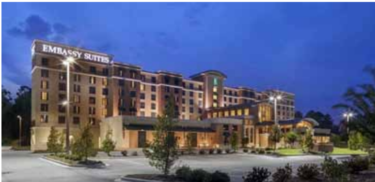
Embassy Suites by Hilton at the Airport

Appreciate the history and romance of Savannah in the downtown area. Take a ghost tour through a haunted cemetery. Stroll the streets of Savannah to discover wisteria, azaleas and moss-covered live