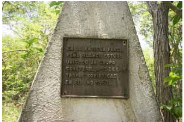
This monument at San Cristobal in Cuba marks the site of a medium-range ballistic missile base.

He decided to adopt a more measured response to the Cuban missile threat, ordering a naval blockade of Cuba, designed to block and turn back any ship carrying offensive military equipment to the island nation.