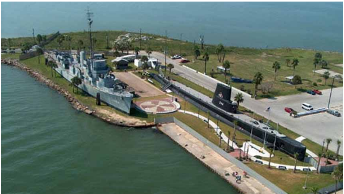
The Cavalla and the USS Stewart. DD-238 in Seawolf Park, Galveston