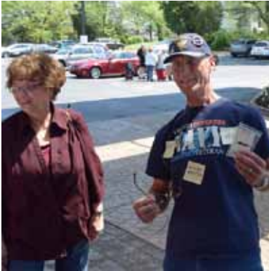
PHOTO GALLERY REUNION MEMORIES II ANNAPOLIS, MARYLAND