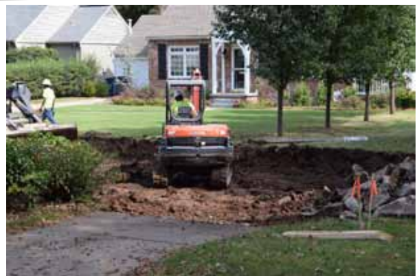
Driveway ends; chaos begins.