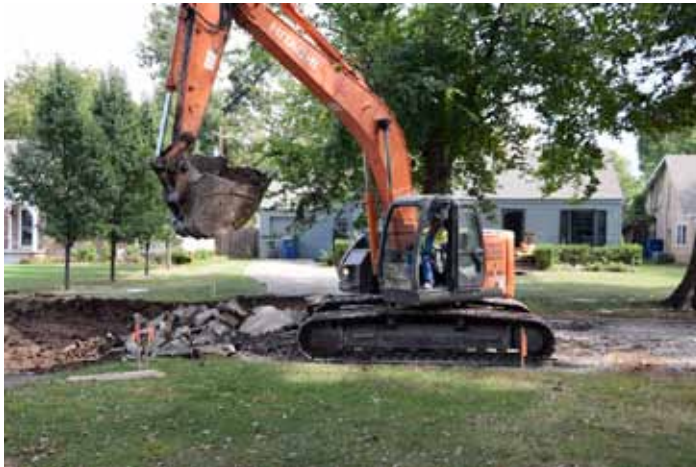
Mechanical T-Rex gobbles up street.

Each time it hit the surface with a huge thump, it literally shook the house and reminded me of Jurassic Park when Jeff Goldblum makes an ob-