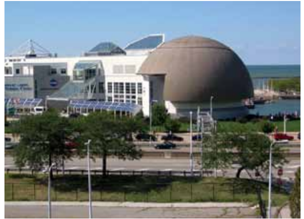
Great Lakes Science Center

See spectacular views of North Coast Harbor as you enjoy delicious meals and nutritious snacks, including oven-baked homemade pizza, hand-crafted sandwiches, satisfying homemade soups and tempting seasonal salads. Burgers, chicken tenders, hot dogs and fries are always available as well!