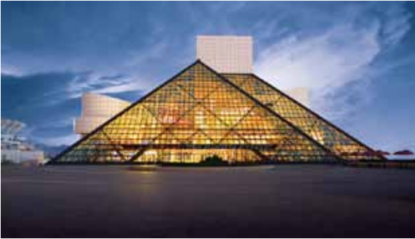
Rock and Roll Hall of Fame

These attractions are all within walking distance from the Cod.